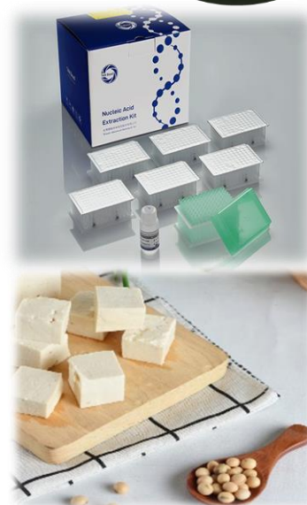
Figure. The performance of Food and Feed DNA Auto Kit was examined through qPCR analysis.